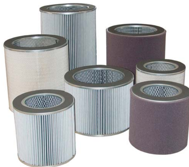
Compact & Large Elements with Metal Endcaps