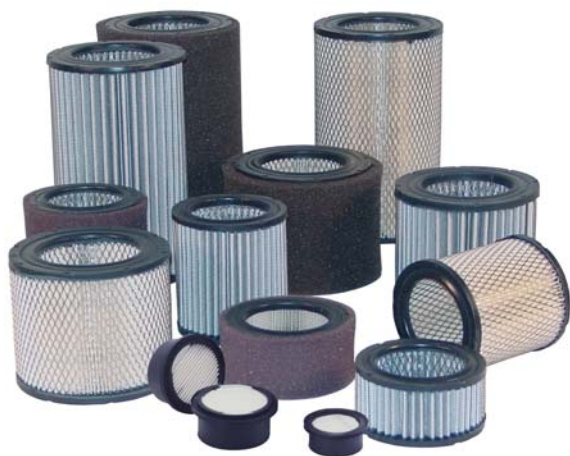
Small Elements with Molded Endcaps