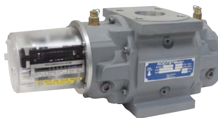
Series B3 2M/3M/5M Meter