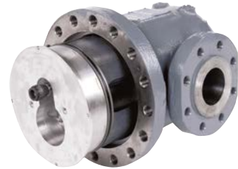
Removable B3-HPC Cartridge