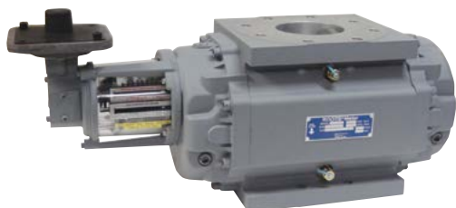
Series B3 7M/11M/16M Meter