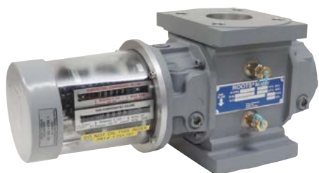
Series B3 8C/11C/15C Meter