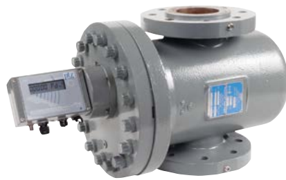
Series B3-HPC with Integral Micro Corrector